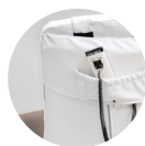
Top protection with and without pockets